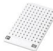
Marker card, Card, white, labeled, Horizontal: Consecutive numbers 1 - 10, 11 - 20, etc. up to 91 - (99)100, Mounting type: Adhesive, for terminal block width: 5 mm, Lettering field: 5 x 3.8 mm

Marker card - SK 5/3,8:FORTL.ZAHLEN - 0804183